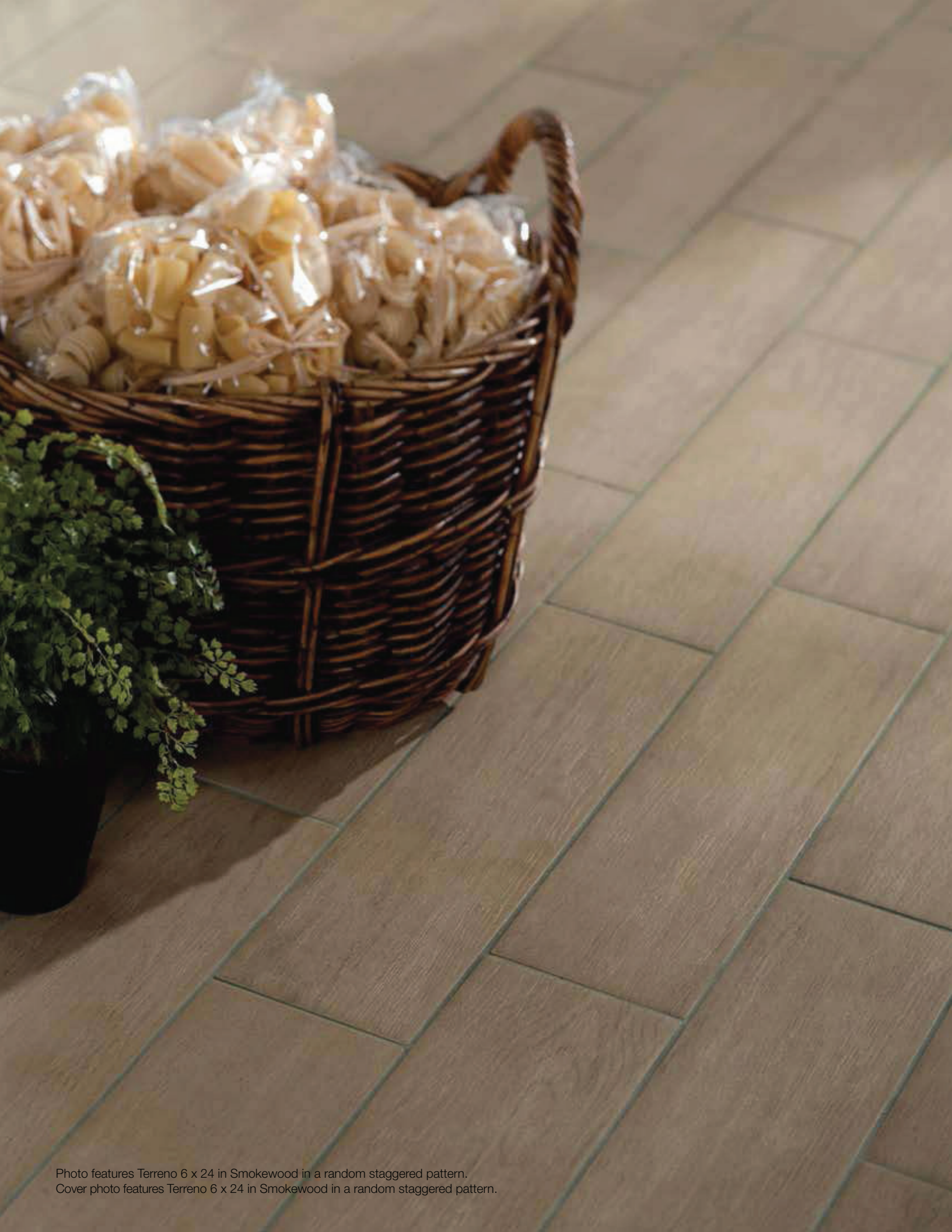
Photo features Terreno 6 x 24 in Smokewood in a random staggered pattern. Cover photo features Terreno 6 x 24 in Smokewood in a random staggered pattern.