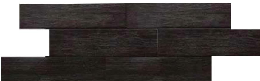
Black Forest TE20